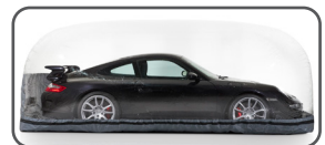
Connect power - Inflate with fan