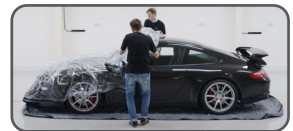
Carefully roll cover over