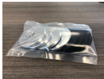
Optional pegged spacer kit

High quality 12.9 strength M8 bolts should be used for all mounting points and we recommend a torque setting of 35nM when fitting the bracket to the side mounting points.