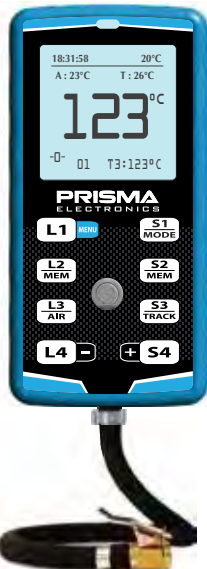
Tyre Pyrometer Mode

It measures and saves AIR and TRACK temperature for each session, save TIME and DATE