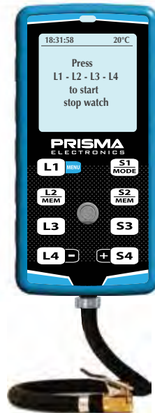
Tyre Pressure Gauge Mode