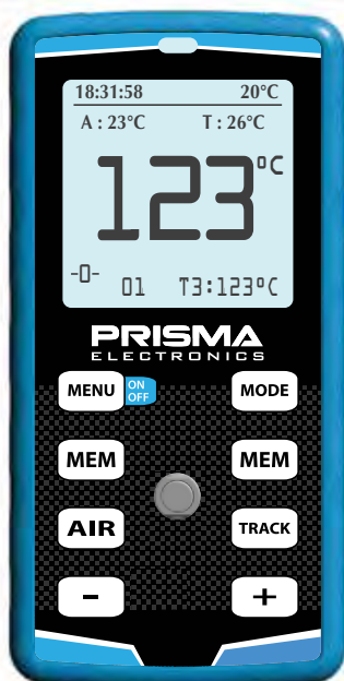
Infrared Sensor Version