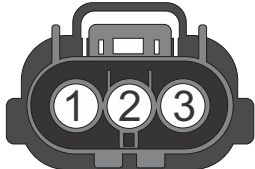
HARNESS SIDE VIEW