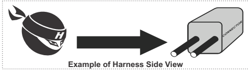
Example of Harness Side View